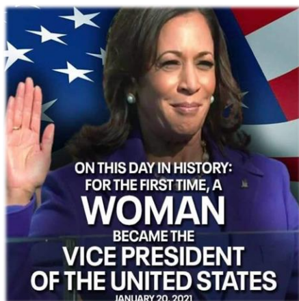
Vice President Kamala Harris