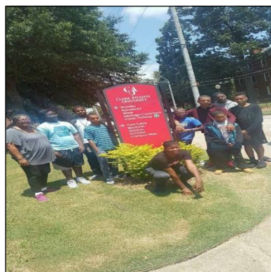
Clark Atlanta University