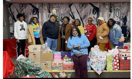
New Sunny Mount Pastor Aid Committee