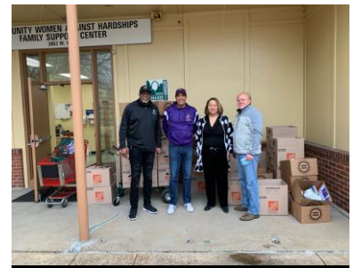
Royal Vagabond Club

Community Women Against Hardship 3963 West Belle Pl. St. Louis, MO 63112 www.cwah.org (314) 289-7523