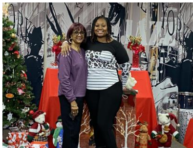
Hopewell Missionary Church