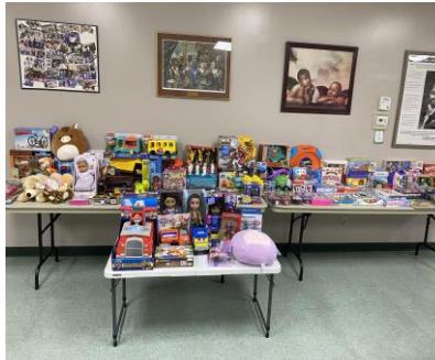
St Louis. University Blue Santa Toy Drive