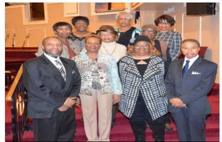
New Sunny Mount Family Support Ministry

“If you want to go fast, go alone. If you want to go far, go together.” - African Proverb