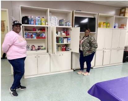
AKA Omicron Theta Omega Chapter

Community Women Against Hardship survives in large part because of the support we receive from the community. This involvement allows us to keep our tentacles in the community. In this issue, we want to thank those who newly support and continue to support our efforts. As we've said before, it takes a village to raise a child and the "villagers" whose selfless contributions benefit our families and help us achieve our mission are greatly appreciated and deserve a special thank you from us to each of you. We applaud your commitment to servicing the community and your diligence in showing up repeatedly.