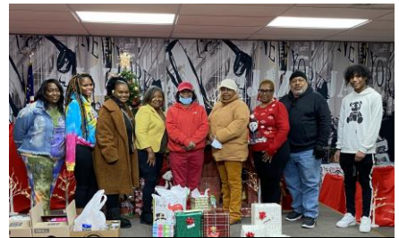
New Sunny Mount Pastor Aid Committee