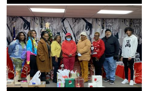
New Sunny Mount Pastor Aid Committee