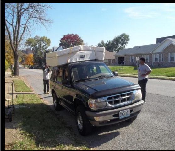
Pictured above client receives beds and mattresses for family after having to start over.